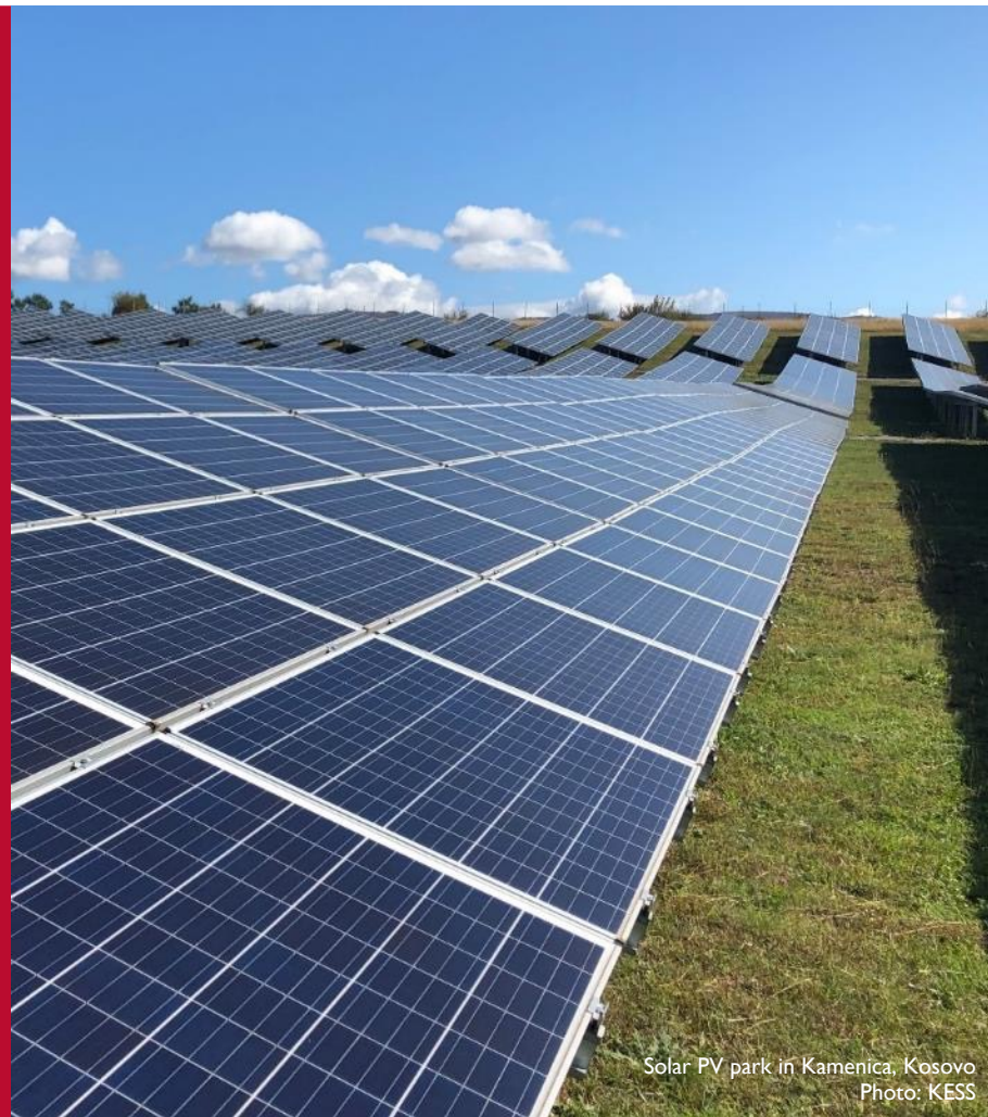
Solar PV park in Kamenica, Kosovo